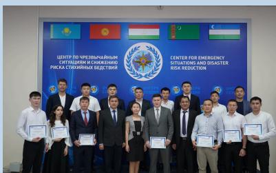
Participants of the specialized training seminar on the use of "Digital Safety Passports" and "Interactive Map" subsystems held from 12 to 23 May 2025 in Almaty.