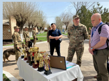
Experts' visit to K-9 training center in Almaty, June 2025.