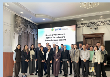
Participants of the meeting of the Tobol-Torgay Basin Council dedicated to integrated water resources management and water conservation strategies held on 26 May 2025 in Kostanay.