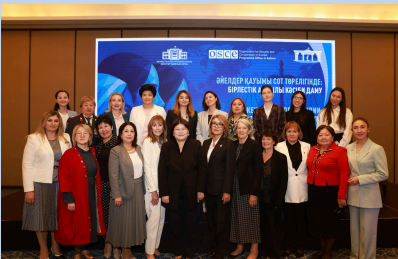
Participants of Central Asian Dialogue Platform "Women in Justice: Professional Development through Association", September 2025.