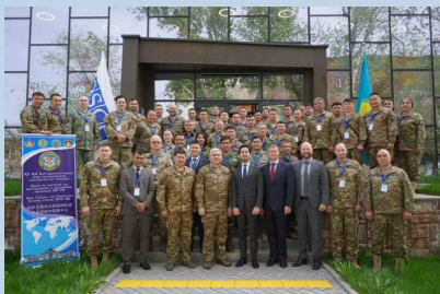
Participants of the International Seminar on the Vienna Document 2011 held in Almaty, 22-24 April 2025.