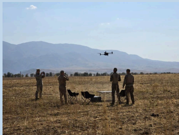
Practical exercises with UAVs during the advanced Training of Trainers for UAV instructors held in Lenger, 4 October 2024.