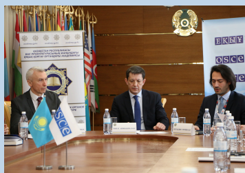
The opening of the workshop "Removing Administrative Barriers Contributing to Corruption" held on 8-9 April 2025 in Kosshy.