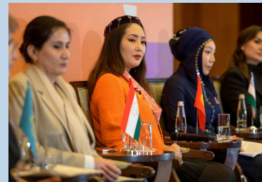
Press panel at the regional conference on combating domestic violence in Central Asia held in Almaty, 25 November 2024.