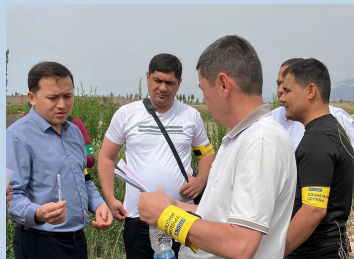
Participants of the Central Asian simulation-based training on human trafficking held in Kyrgyzstan, June 2025.